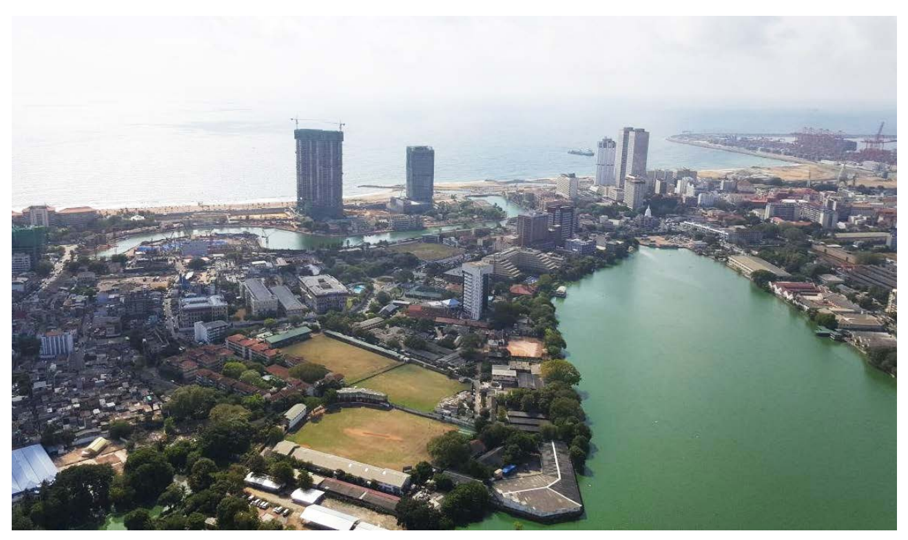
Beira Lake, Colombo.

Learning from the transformation of the Singapore River.