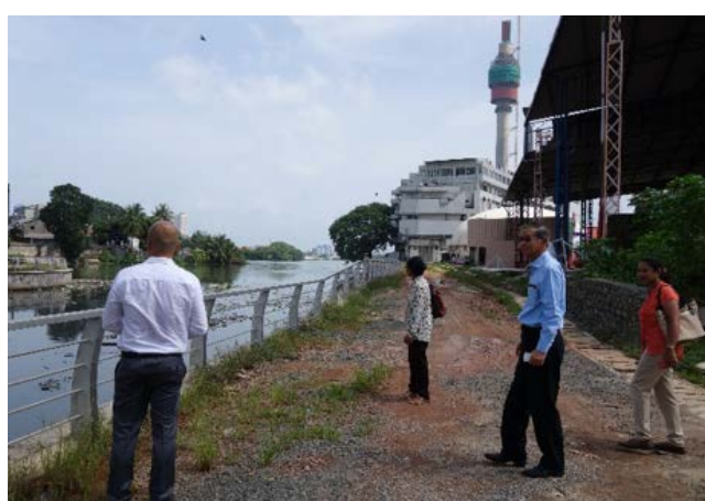
Deep-dive workshop discussions and site visits in Colombo.

conducted for over 200 officials from Sri Lanka's various ministries, agencies and municipal councils to enhance their capacities, particularly in the areas of Master Plan Review & Government Land Sales, Water Infrastructure & Greening, and Housing Design and Community Building.