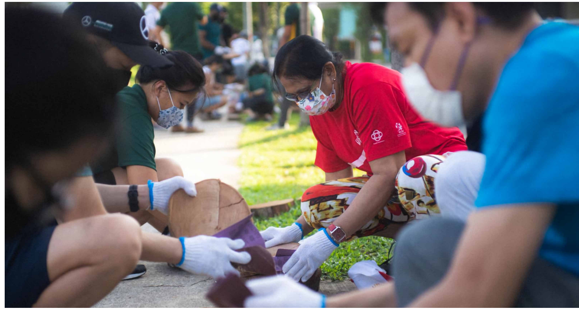
Residents preparing wood cookies for the community-designed and managed green corridor.