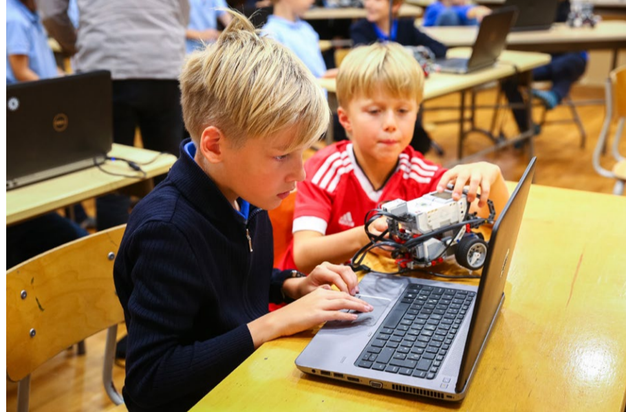
Digital infrastructure is highly accessible in Tallinn, where students are exposed to the applications of technologies from a young age.