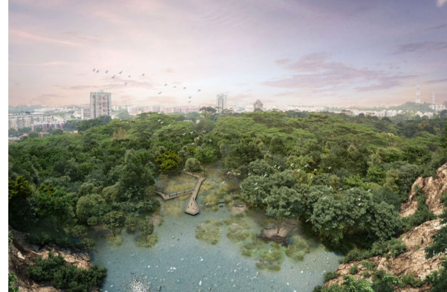
Artist's impression of the upcoming Rifle Range Nature Park, which provides more space for nature-based recreation.