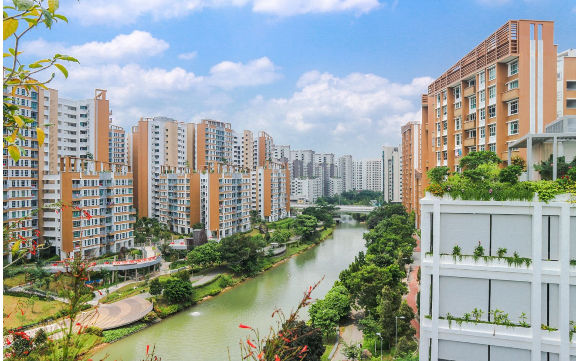
HDB flats along the Punggol Waterway, Singapore.