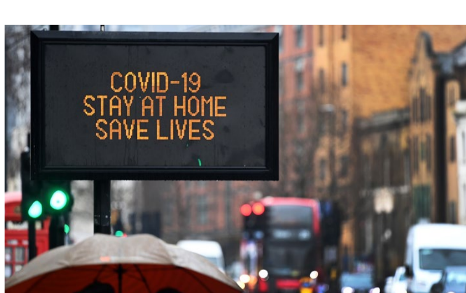
A COVID-19 public notice in London, England.