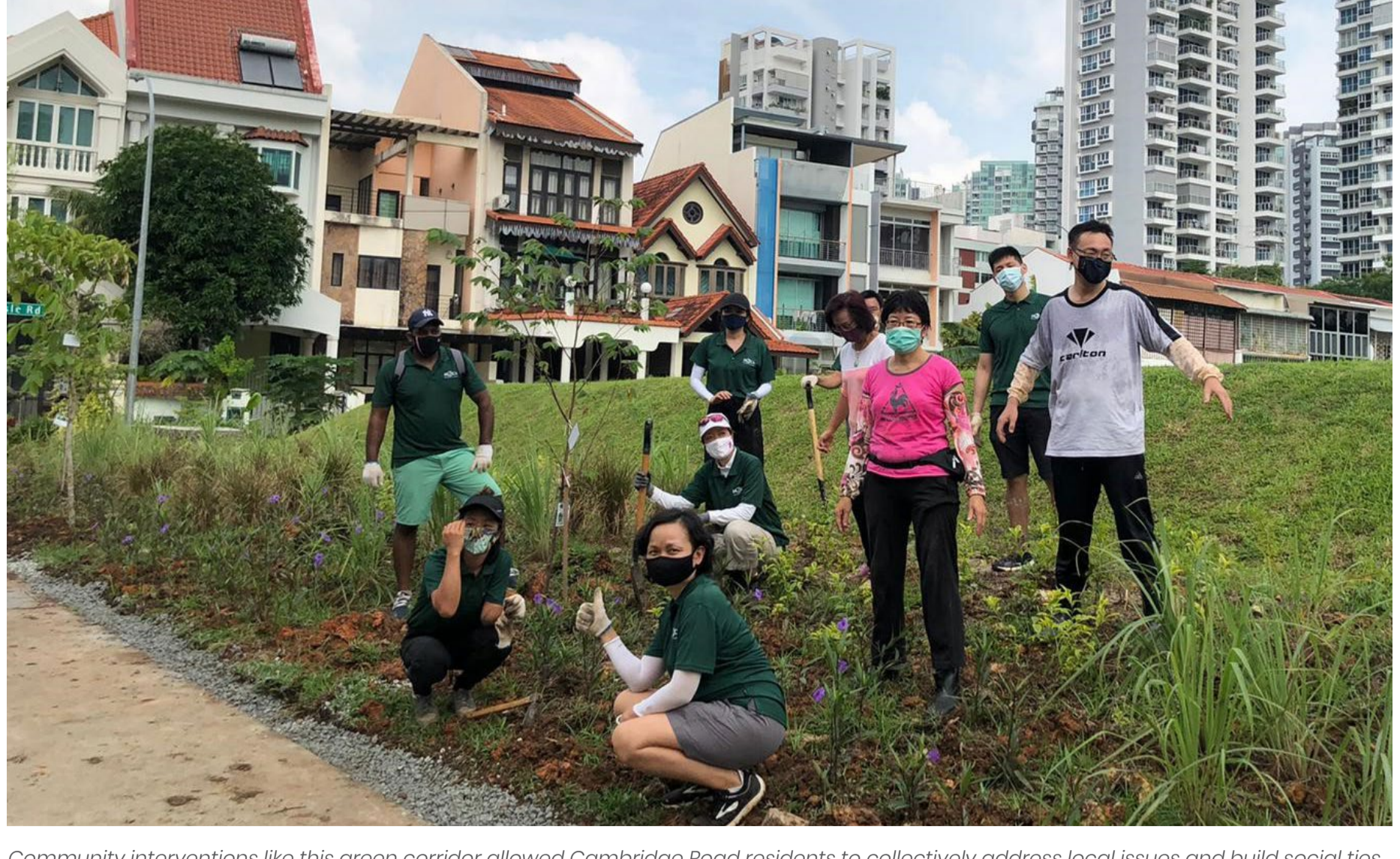
Community interventions like this green corridor allowed Cambridge Road residents to collectively address local issues and build social ties with one another.