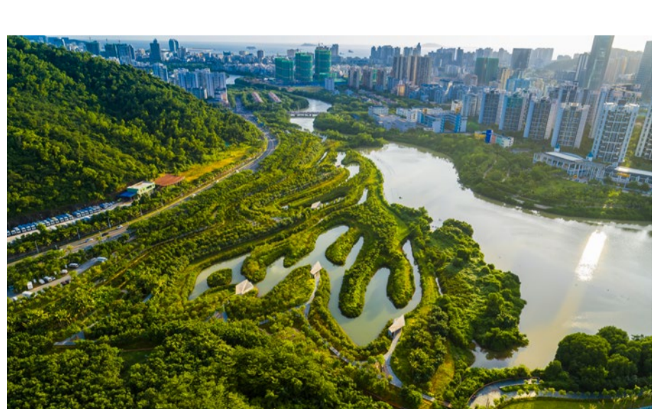
An aerial view of Sanya Mangrove Park.