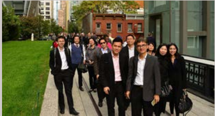
6th LUGP participants learning about urban rejuvenation and adaptive reuse at The Highline in New York City.