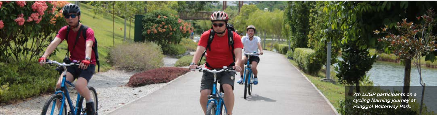
7th LUGP participants on a cycling learning journey at Punggol Waterway Park.

Flagship programme for senior urban leaders