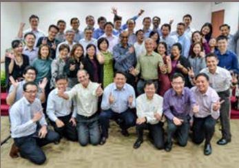
8th LUGP participants and LUGP Alumni in a Dialogue with Mr Tharman Shanmugaratnam, Deputy Prime Minister & Coordinating Minister for Economic and Social Policies.

LUGP is designated by the Infrastructure and Environment (I&E) Sectoral Leadership Committee (comprising permanent secretaries of the sector) as a milestone course for the capability development of the sector. It is a practitioner-led course designed for senior high-performing Singapore public service officers in the I&E sector demonstrating leadership potential and aspiring to acquire broader perspectives on the urban development of Singapore.