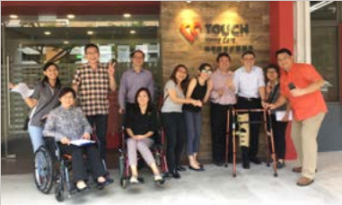
8th LUGP participants taking part in the “Town Audit” trail walk at Ang Mo Kio facilitated by TOUCH Caregivers Support to get a feel of the challenges faced by seniors with mobility constraints.