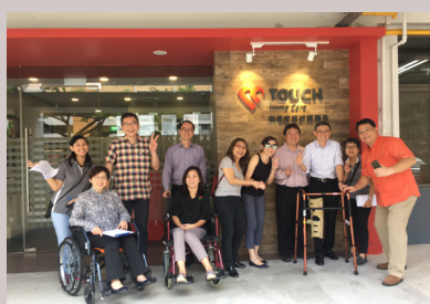
Participants taking part in the "Town Audit" trail walk at Ang Mo Kio facilitated by TOUCH Caregivers Support to get a feel of the challenges faced by seniors with mobility constraints.