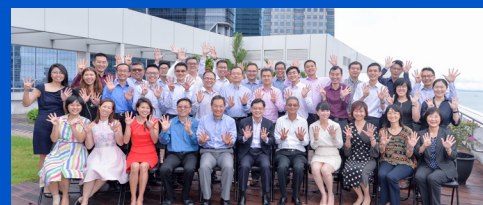
LUGP participants' closing dialogue with Mr Heng Swee Keat, then Minister for Finance.

Participation is by nomination only, for promising director-level officers with potential to assume senior management positions.