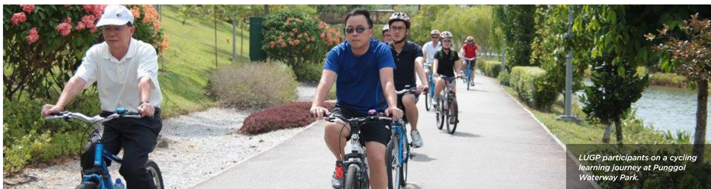
LUGP participants on a cycling learning journey at Punggol Waterway Park.

Flagship programme for senior urban leaders