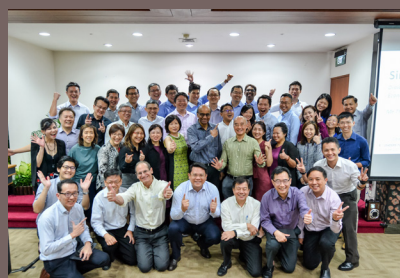
Participants in a dialogue with Mr Tharman Shanmugaratnam, then Deputy Prime Minister and Coordinating Minister for Economic and Social Policies.

LUGP is designated by the Infrastructure and Environment (I&E) Sectoral Leadership Committee (comprising permanent secretaries of the sector) as a milestone course for the capability development of the sector. It is a practitioner-led course designed for senior high-performing Singapore public service officers in the I&E sector demonstrating leadership potential and aspiring to acquire broader perspectives on the urban development of Singapore.