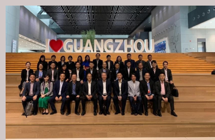
LUGP participants visited Guangzhou as part of the learning about the development of the Greater Bay Area, including its planning, strategies and challenges faced.