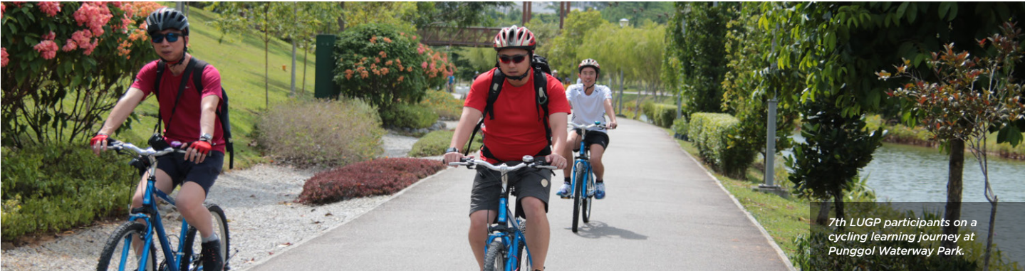
7th LUGP participants on a cycling learning journey at Punggol Waterway Park.

Flagship programme for senior urban leaders