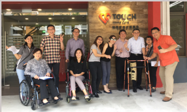
8th LUGP participants taking part in the “Town Audit” trail walk at Ang Mo Kio facilitated by TOUCH Caregivers Support to get a feel of the challenges faced by seniors with mobility constraints.