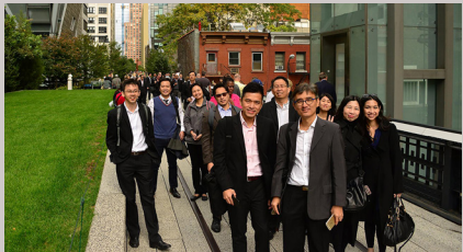
6th LUGP participants learning about urban rejuvenation and adaptive reuse at The Highline in New York City.