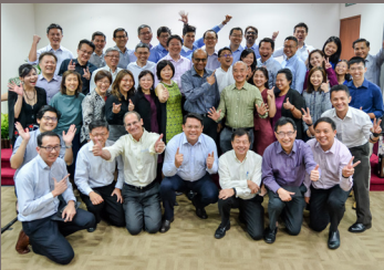
8th LUGP participants and LUGP Alumni in a Dialogue with Mr Tharman Shanmugaratnam, Deputy Prime Minister & Coordinating Minister for Economic and Social Policies.

LUGP is designated by the Infrastructure and Environment (I&E) Sectoral Leadership Committee (comprising permanent secretaries of the sector) as a milestone course for the capability development of the sector. It is a practitioner-led course designed for senior high-performing Singapore public service officers in the I&E sector demonstrating leadership potential and aspiring to acquire broader perspectives on the urban development of Singapore.