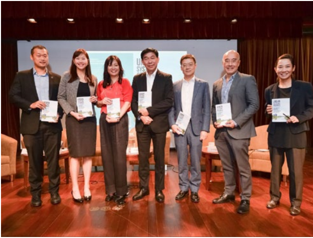
Panellists are presented with the Urban Systems Studies book as a token of appreciation for their time and contribution to this knowledge sharing session.