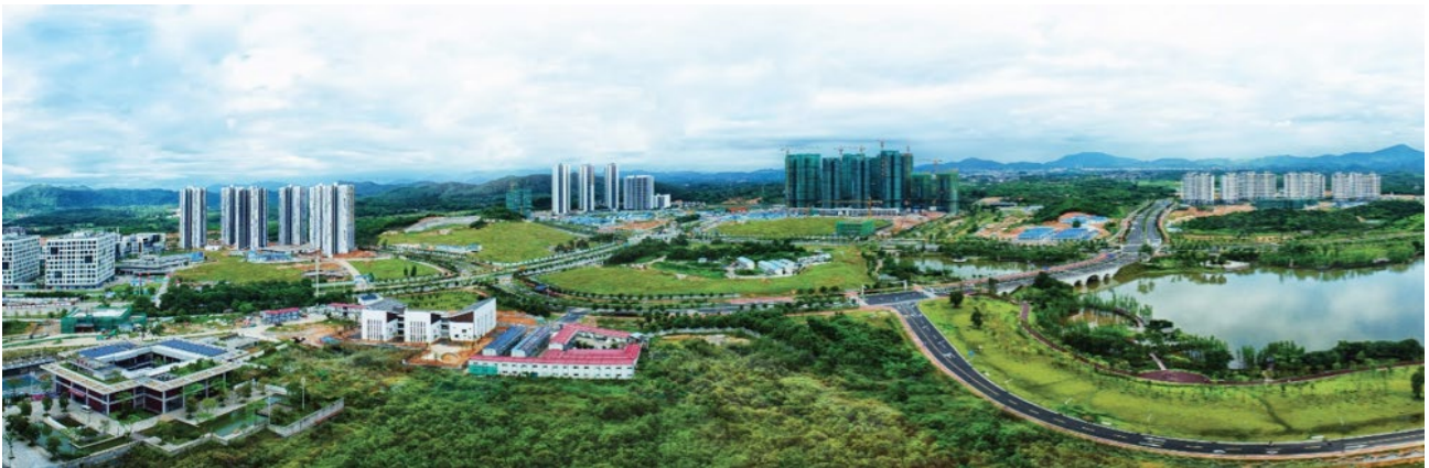
Aerial View of Sino-Singapore Guangzhou Knowledge City, Southern Start-Up Area.

Singapore is not a technology powerhouse, but we are a very good aggregator, able to put together all the hardware, the software and the intangibles that make a city liveable. That's why we have been focusing not only on the physical development and infrastructure, which the Chinese are very good at, but also on things like [intellectual property] and good schools.