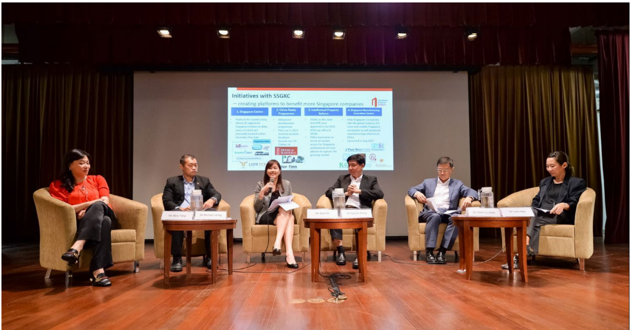
The panel, consisting of public and private sector players discussed enterprise-led, government-supported and market-driven collaborations in Guangzhou Knowledge City.