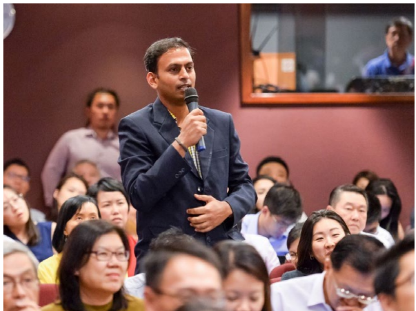
Participants are given a chance to interact with the panellists during the Question & Answer session.