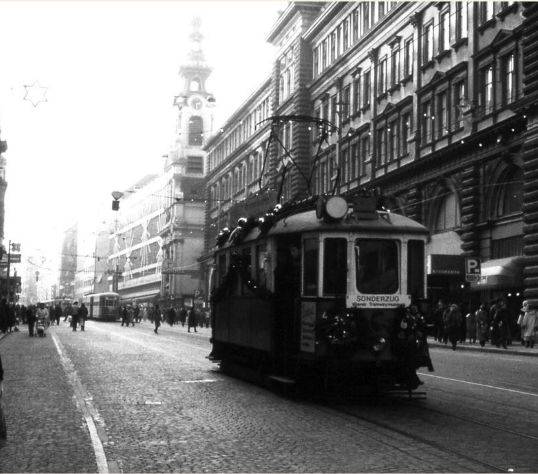
The streets of Mariahilf district in the 1980s with their narrow sidewalks.